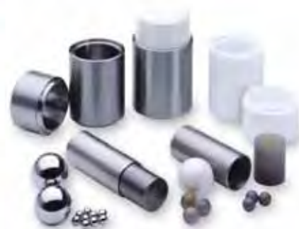
Grinding jars with push-fit lids for MM 200