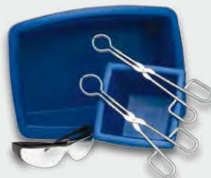
The CryoKit consists of: 2 insulated containers (1 and 4 liter), 2 pairs of grinding jar tongs 1 pair of safety glasses.

The screw-top grinding jars are particularly suitable for cryogenic grinding, as they remain hermetically sealed until they have regained room temperature. This prevents atmospheric humidity from condensing on the cold sample as water vapor which could penetrate the sample and falsify the analytical results. However, jars made from agate or ceramics should not be cooled with liquid nitrogen in order to avoid damages during the grinding process.