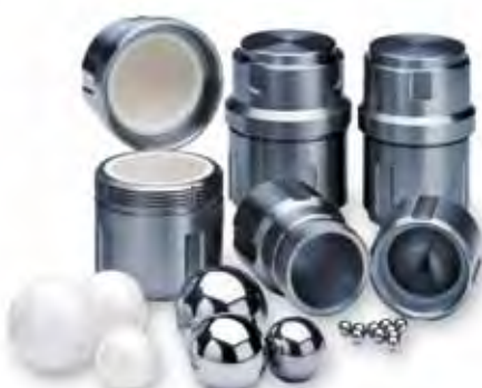
Screw-top grinding jars for MM 400

In addition to the standard grinding jars with push-fit lids for the MM 200, superior screw-top grinding jars for the MM 400 are available.